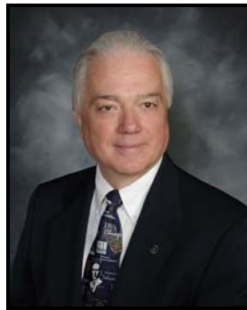
2008-2009 District Governor 5580

As this is written the waters of the Red River in Fargo-Moorhead are at thirty nine feet down from the crest of forty point eight two feet but still twenty five feet over its normal level. The folks in Fargo-Moorhead are in a combination of breath holding and a lot of activity to shore up and repair breeches in the dikes. The effort is not aided by winter keeping its icy grip with a blizzard predicted to drop at least twelve inches of new snow in twenty-five mile an hour winds that has started and is to last three days. The flood threat affects only a small part of the District; the blizzard most of us. There may be yet another storm behind this one. Hopefully the LEAD training already postponed once will not be affected.