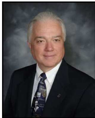
2008-2009 District Governor 5580

At the outset let me express my hope that you all had a great holiday and wish you a happy New Year. For the 2008-2009 Club Presidents and District leadership, we have six months left to Make Dreams Real.